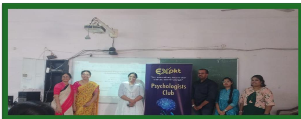
With EXpkt NGO ,Vijayawada