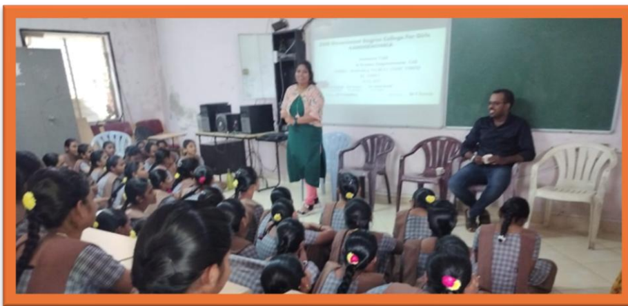
Interactive session with students